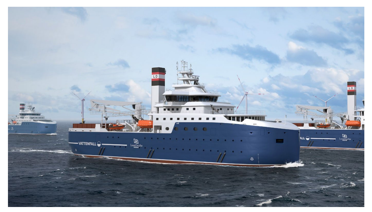
SOVs on order for Vattenfall